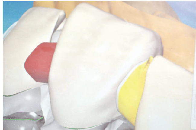
Figure 6. Virtual design of connected provisional veneers before milling.

checked and adjusted. The provisional veneers were reevaluated after a few weeks following the patient's evaluation of form, function, and esthetics. The patient requested modifications that were performed and communicated to the dental laboratory. The definitive laminate veneer designs were modified and milled from low translucency IPS e.max (Vita