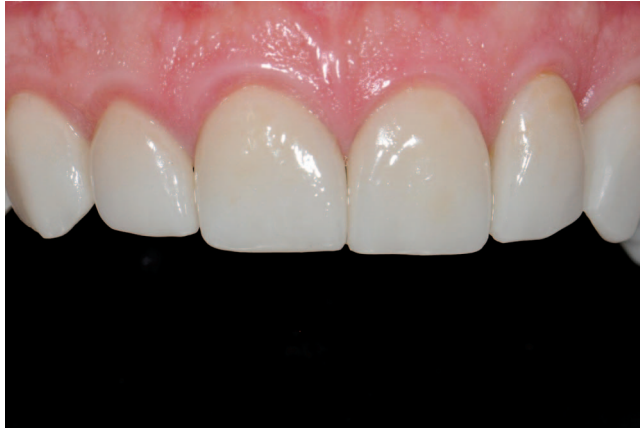
Figure 8. After cementation of lithium disilicate ceramic veneers.

A1) milling blocks (Ivoclar-Vivadent, Amherst, NY, USA) at a remote milling center.