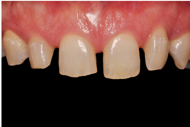
Figure 1. Pretreatment frontal view of maxillary anterior teeth.

declined surgical intervention because he has a low smile line that would not affect the social or esthetic outcomes of his treatment. Vital whitening provides the operator with the opportunity to use a translucent glass ceramic, allowing the stump shade to control the final color. Porcelain laminate veneers are considered a conservative treatment with predictable clinical results. 10,13