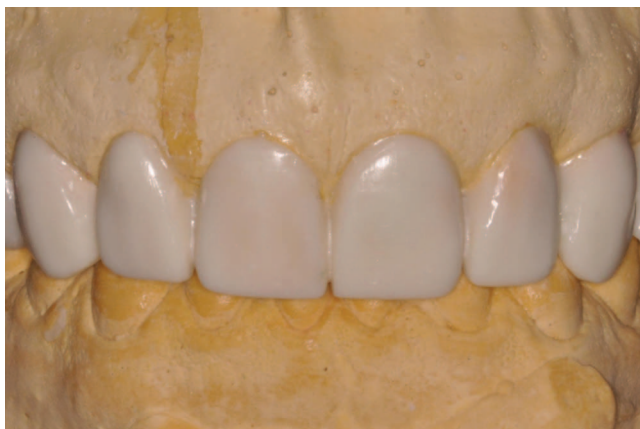
Figure 2. Diagnostic wax-up of maxillary anterior teeth mounted in semiadjustable articulator.

Initial diagnostic impressions were taken for treatment planning using irreversible hydrocolloid impression material (Jeltrate Fast Set, Dentsply Caulk, Milford, DE, USA) and poured with type III dental stone (Buff Stone, Whip Mix Corp, Louisville, KY, USA). Casts were articulated on a semi adjustable articulator (Model 2240, Whip Mix Corp) with a face-bow transfer (Model 8645, Whip Mix Corp). A diagnostic wax-up was completed by the laboratory for patient presentation of proposed shape and contour of final laminate ceramic veneers and provisional stent fabrication (Figure 2).