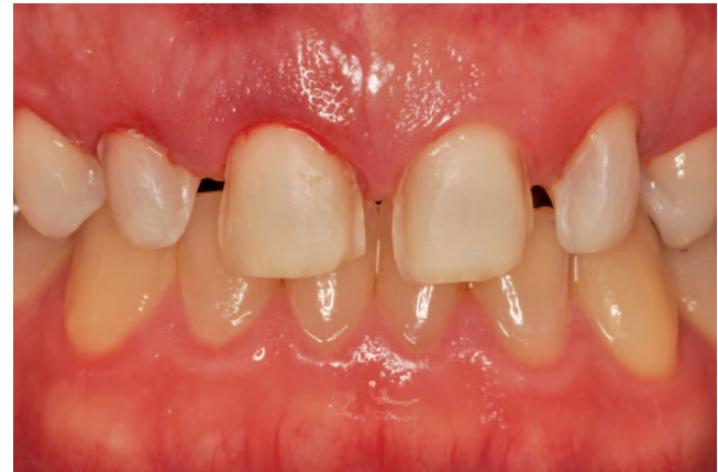
Figure 3. Frontal view of maxillary anterior teeth after preparation for ceramic veneers.

Teeth whitening treatment started with an at-home whitening kit using 15% carbamide peroxide (Opalescence PF 15%, Ultradent Corp, South Jordan, UT, USA) overnight daily for six weeks. The patient's initial tooth shade was Vita A3.5. Preparations were started for laminate ceramic veneers after achieving an acceptable shade (Vita A1) and waiting 14 days post whitening for oxygen free-radical dissipation and possible color regression (Figure 3). The maxillary anterior teeth were prepared with a butt-joint margin on the lingual surfaces, 1.5-mm reduction of the incisal edges and 0.3-mm (gingival) to 0.8-mm (incisal) reduction on facial surfaces using a round-ended diamond cutting instrument (Brasseler USA, Savannah, GA, USA) and a reduction guide (Figure 3).