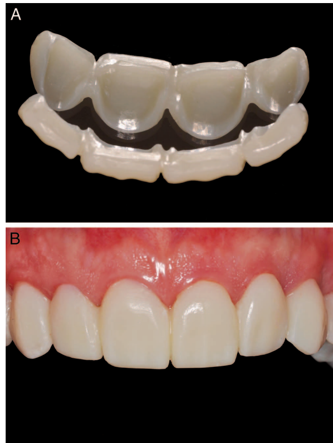
Figure 7. (a): provisional PMMA veneers and (b): PMMA veneers cemented as a long-term provisional.

checked and adjusted. The provisional veneers were reevaluated after a few weeks following the patient's evaluation of form, function, and esthetics. The patient requested modifications that were performed and communicated to the dental laboratory. The definitive laminate veneer designs were modified and milled from low translucency IPS e.max (Vita